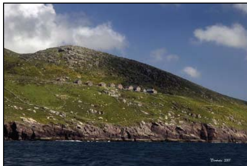
the village rebuilt for artists 2009